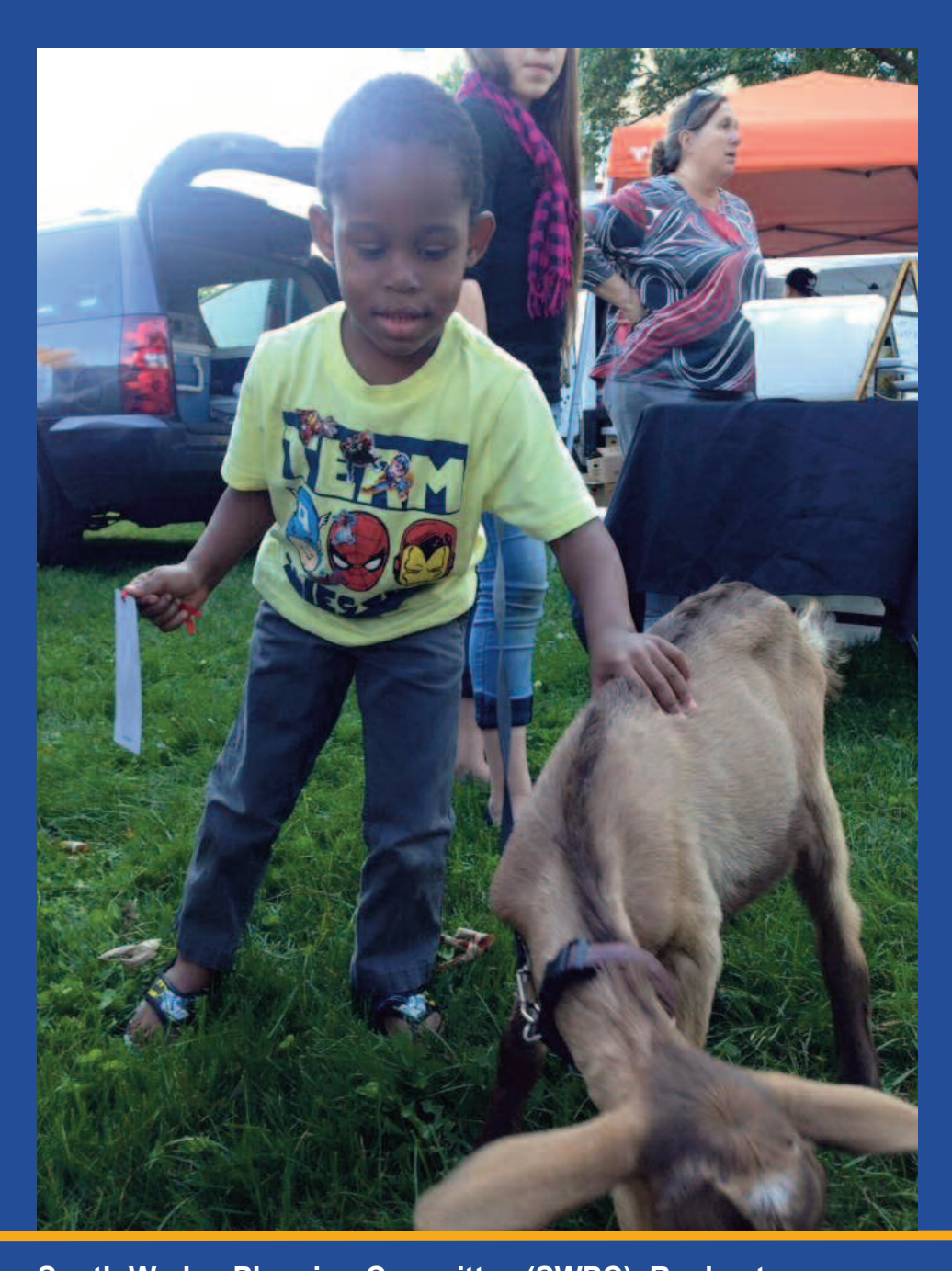
South Wedge Planning Committee (SWPC), Rochester