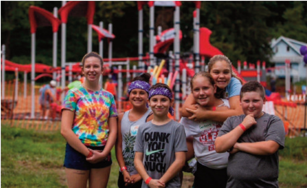
Right: Kids assist with a new community-built playground. Rural Revitalization Corporation, an RPC, provided seed funding for the project and worked with the City of Salamanca to activate an underutilized city park.