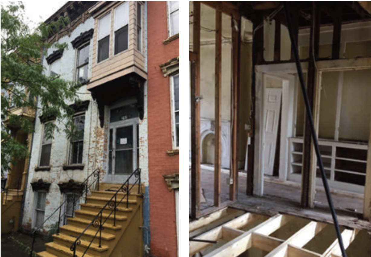
Above: Exterior and interior renovations are being completed by the Albany Housing Coalition, and NPC, for this 1870's historic Italianate rowhouse in the Arbor Hill neighborhood.