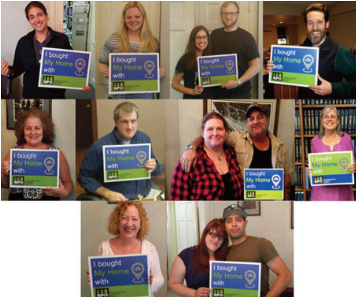
Above: Proud homeowners who purchased their homes with assistance from Rural Preservation Company, RUPCO. In 2017, RUPCO assisted over 100 first time home buyers in the Hudson Valley.

Article XVI of the Private Housing Finance Law requires that at least one dollar in match be generated for every three dollars of preservation funds received. The required program match for 2017-18 was one-half the awarded amount. Match funds are additional funds reported by the N/RPCs as received and expended during the contract period to defray administrative costs or capital projects. N/RPCs are encouraged to apply for grants and fundraise to meet the N/RPP match requirements.