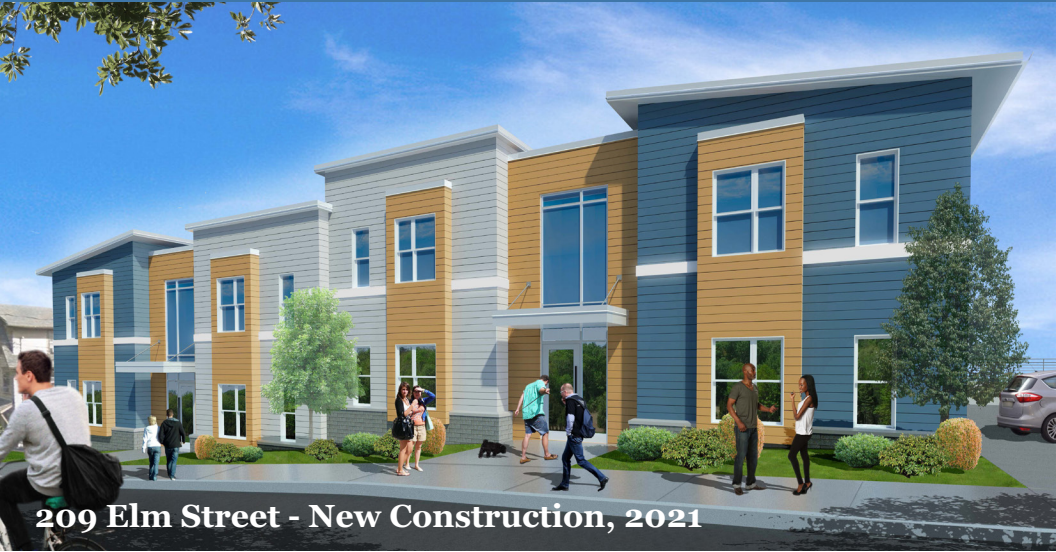
209 Elm Street - New Construction, 2021

A rehab and new construction INHS project in the City of Ithaca. Future rental opportunities available. Inquire today!